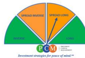
PCM Absolute Bond (World Bonds)

Going into July, our composites moved to "Spread Long" in both the US and International space. Specifically, US Industries has moved to 50% cash equivalent and 25% each Healthcare and Medical Devices. PCM's Absolute International is 25% each in cash equivalent, international treasuries, New Zealand, and Singapore. PCM's Absolute Bond is "Spread Long" with 50% in cash equivalents and 50% international corporate bonds. Each of the above composites may be reallocated monthly with the exception of PCM's Absolute Bond, which may reallocate bi-monthly.