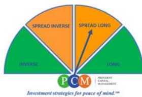
PCM U.S. Industries (US Equities)