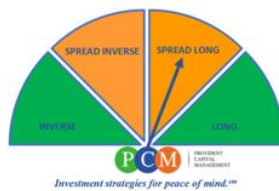
PCM Absolute International (International Equities)